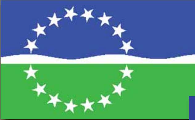
HAMPTON ROADS, VA